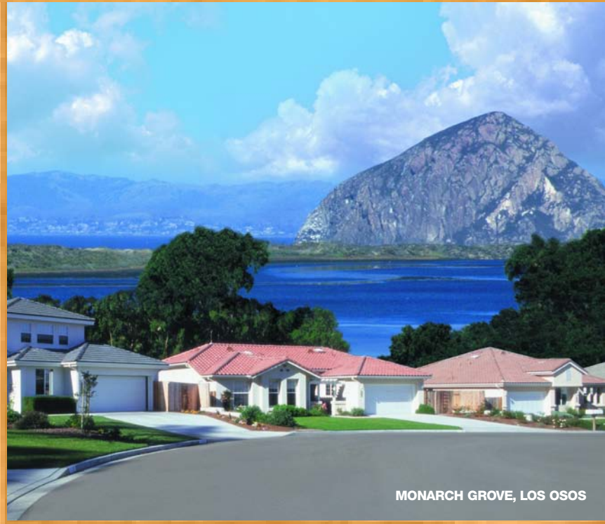
MONARCH GROVE, LOS OSOS